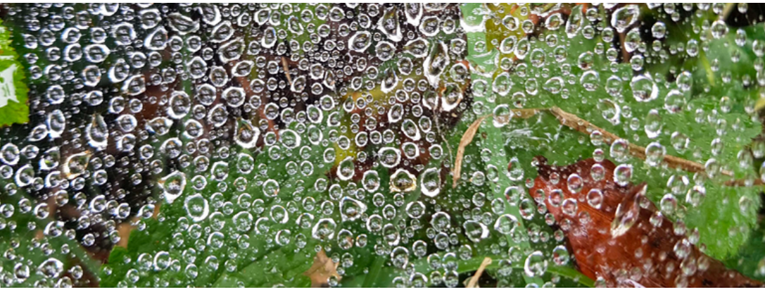
[Together-aloNE]YF/ JUIN 2022